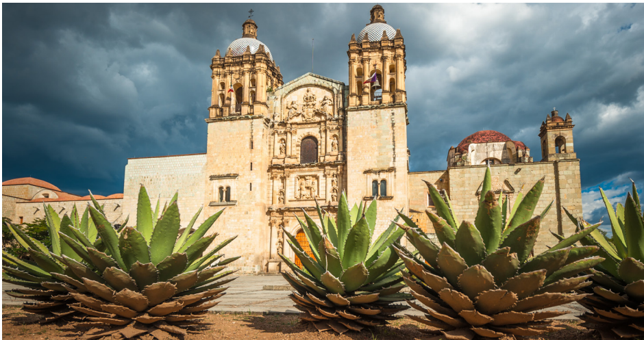
Church of Santo Domingo