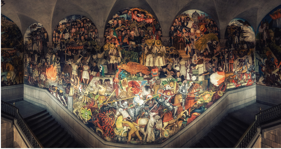
National Palace Murals by Diego Rivera