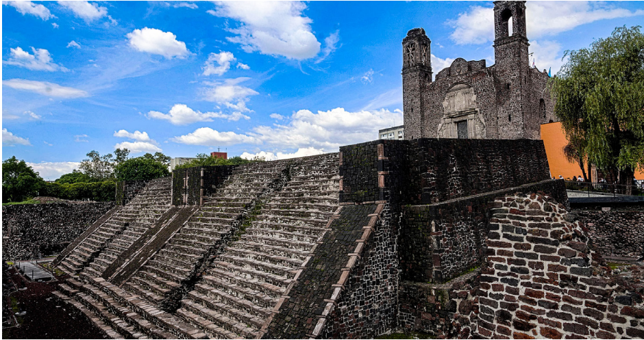
Plaza of the 3 Cultures